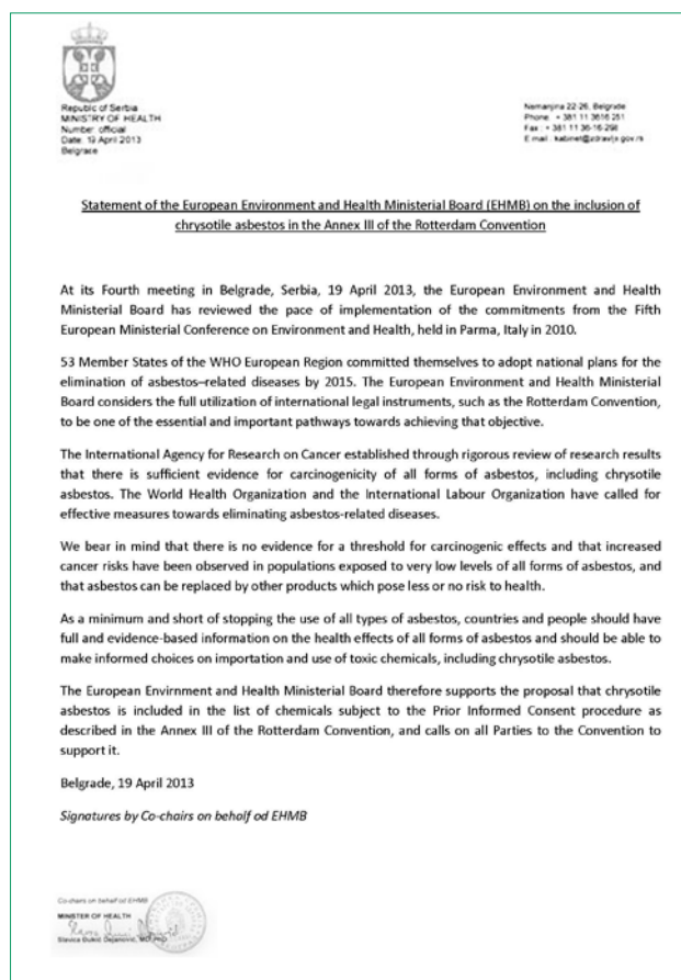
Fig. 1. Statement of the European Environment and Health Ministerial Board, April 2013

(18). Under the Convention, waste that contains asbestos dust and asbestos fibres is considered hazardous waste (Annex I, item Y36) and is, therefore, subject to strict control.