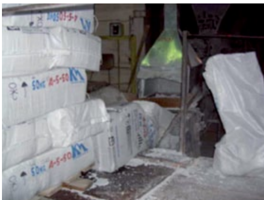
Fig. 3. Asbestos cement factory (left) and sample collection from a demolition site (right)

Women Information Centre, the Social Ecological Forum, MAMA-86 and BIOM), located in five countries where asbestos is of concern, launched a campaign of awareness-raising activities. Initially, an inventory was conducted to assess the scale of production and use of asbestos in those countries, as well as the general knowledge, attitudes and practices regarding asbestos. This provided some information on the production and use of asbestos and on current legal requirements (Fig. 3). Further activities