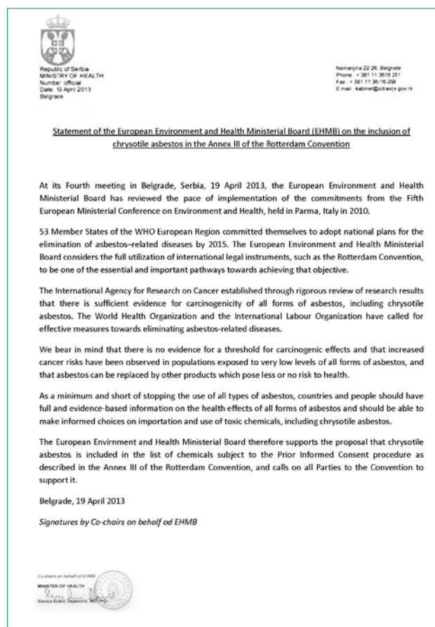
Fig. 1. Statement of the European Environment and Health Ministerial Board, April 2013

(18). Under the Convention, waste that contains asbestos dust and asbestos fibres is considered hazardous waste (Annex I, item Y36) and is, therefore, subject to strict control.