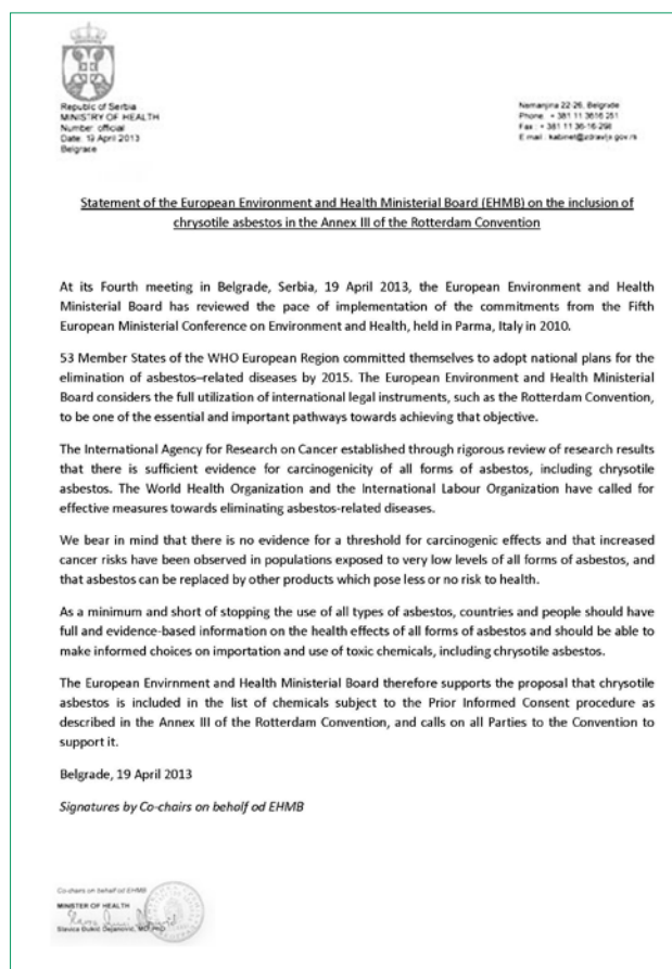
Fig. 1. Statement of the European Environment and Health Ministerial Board, April 2013

(18). Under the Convention, waste that contains asbestos dust and asbestos fibres is considered hazardous waste (Annex I, item Y36) and is, therefore, subject to strict control.